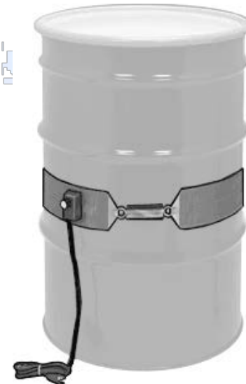
A common band heater (McMaster Carr, model 35275K31 )

Often useful to thaw drum material while on pallets